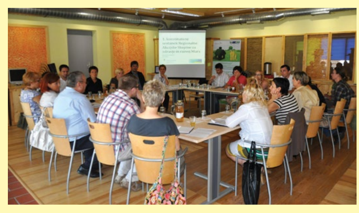
Inaugural RAG meeting, Slovenia © CHD 2012.

These needs assessment inform the changes and actions to close the gap between the present and desired situation in a seven year